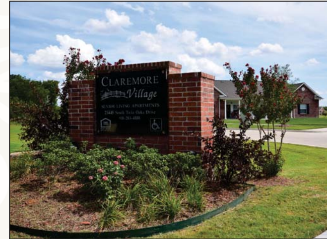
A Senior Living Community